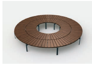
Jada Double circle